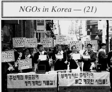
Leaders of the Anti-Corruption Network in Korea (ACNK), an alliance of 900 citizens' groups, stage a campaign for realizing a clean parliamentary election on a street in Myeongdong, downtown Seoul, last March.

In late 1999, the group launched a campaign to amend Korea's election laws, making it mandatory for election candidates to reveal past records of corruption and criminal activity. The group's campaign took the group members out on the street to collect signatures and a petition to the National Assembly. In December, a petition bearing 4,119 names was presented and the Assembly passed the bill, which obligates election candidates to disclose their criminal records as well as tax and military records.