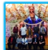
Pacific Forum, Page 3