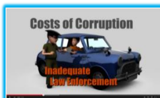
TI SRI LANKA NIS VIDEO