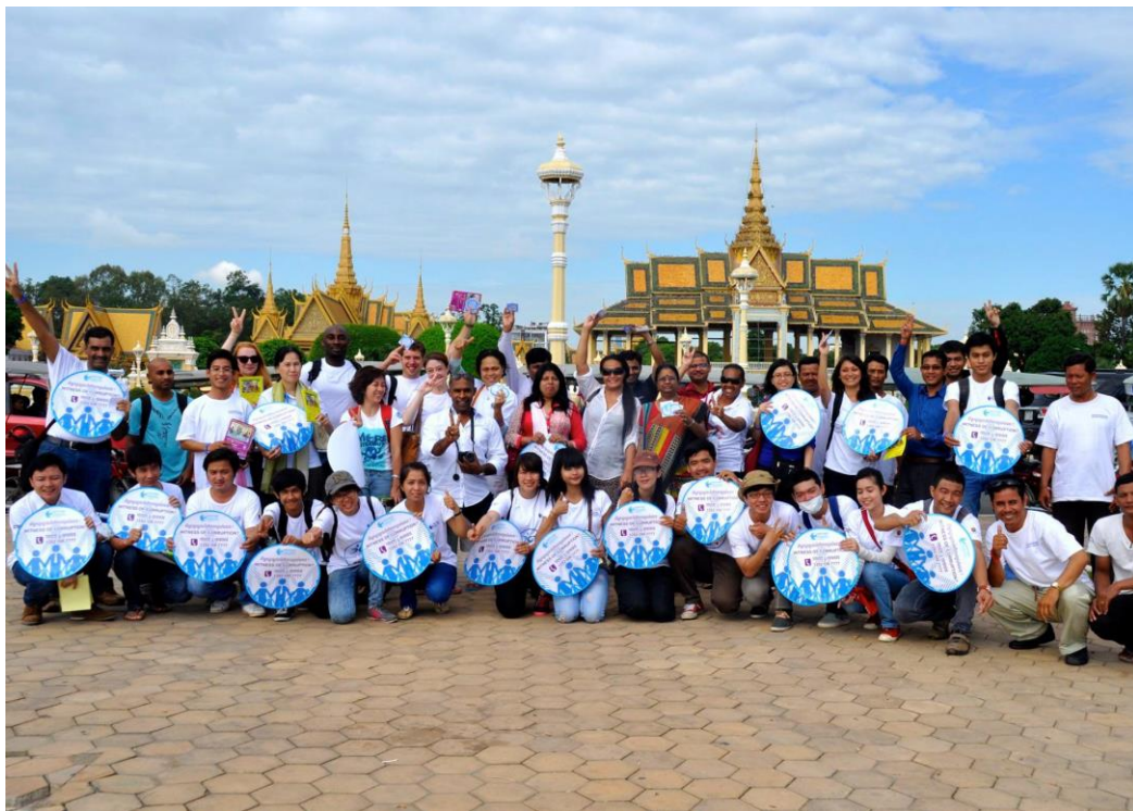
Speak Up Asia Pacific Workshop, Phnom Penh Cambodia – Page 2