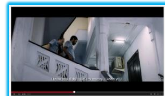
TI INDONESIA ANTI-CORRUPTION MOVIE