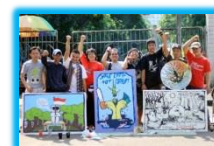
Unmask the Corrupt Campaign Page 7