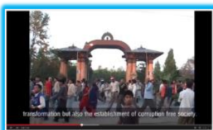
TI NEPAL PROMOTIONAL VIDEO

Click on the pictures below to see these recently released videos by some of our Chapters.